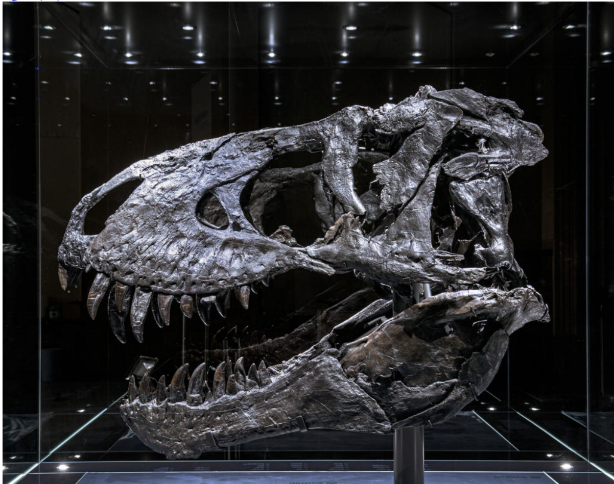
Figure 1. The "Tristan Otto" Tyrannosaurus rex skull that was examined by researchers.