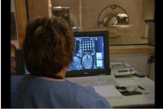
Video 3. MRI brain images displayed on monitor