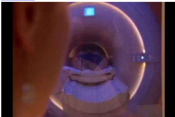
Video 2. Series of brain MR images on computer screen