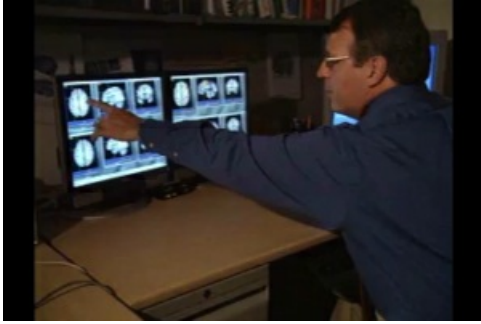
Video 3. Radiologist reviewing brain MR images.