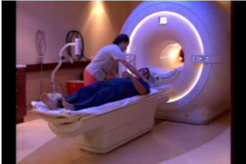
Video 4. Patient being loaded into the MRI scanner.