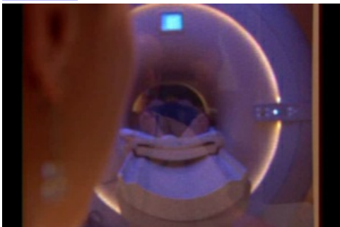
Video 6. Display of MR brain images.