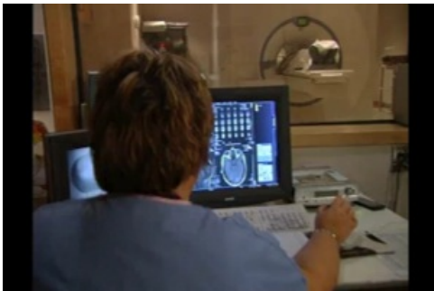
Video 2. View from control room of patient undergoing brain MRI.