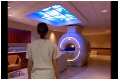
Video 5. Patient being unloaded from MRI scanner.