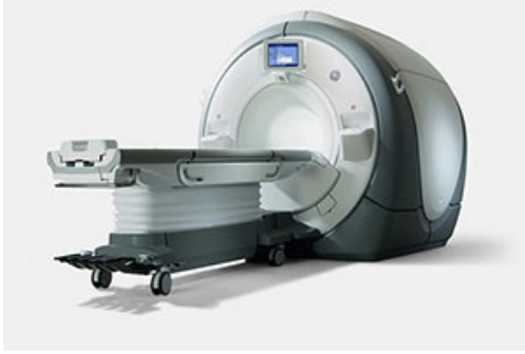
Figure 1. GE Discovery MR750 3.0T.