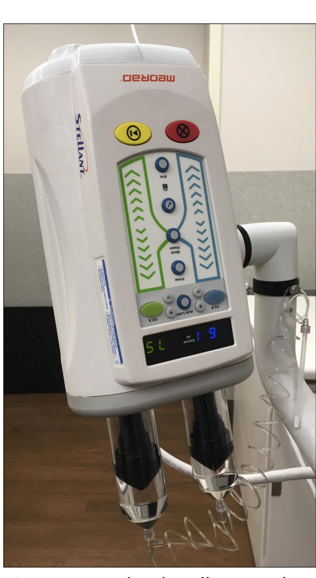
Figure 1: MedRad Stellant Dual Syringe injector injecting a small volume of saline (blue column) at the same rate as the IV contrast (green column) prior to contrast injection.