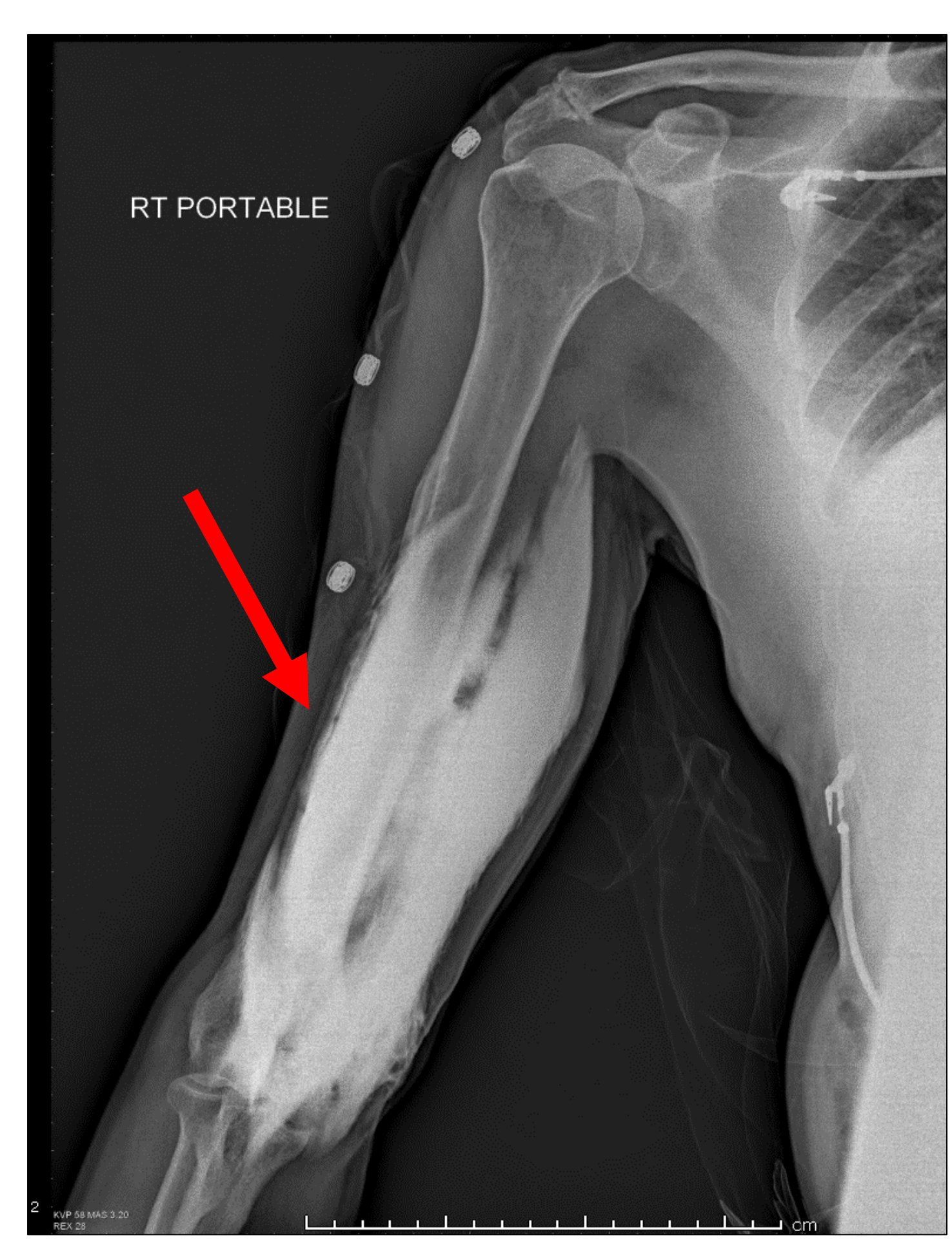
Figure 2: Example of contrast extravasation from a CT pulmonary embolism study. IV contrast is seen in the muscle fascial planes of the right biceps (red arrow).

Background : Extravasation of IV contrast during a CT scan is not an uncommon event that harms patient safety, with rare instances of severe complications. Besides the possible complications of contrast extravasation as well as patient inconvenience, these events also disrupt workflow of the health care team since assessment of the patient is needed with observation required after the event. In most instances, extravasated IV contrast causes only temporary pain and swelling, however in severe cases, long term pain and impairment requiring surgery have been reported. The purpose of this study is to assess whether reduction of IV contrast extravasation can be achieved using pre-injection of saline through a power injector to assess the viability of the IV prior to contrast injection. The rationale is that extravasation of small volume of normal saline is preferable to extravasated contrast, with the latter resulting in more severe complications.