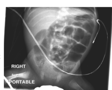
Fig 3. – Please note on the image on the right, lead shield covering the gonads of this male child. Also note, lead collimator lines on two sidies of this image.