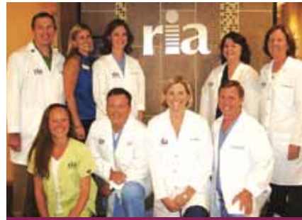
Radiology Imaging Associates

serve with the most advanced radiology services available. The R&E Foundation would like to thank Radiology Imaging Associates and all of the VIP practices for their strong support.