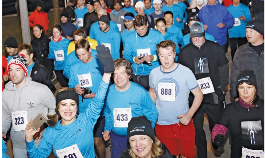
2017 Fun Run participants on the move to support the Foundation