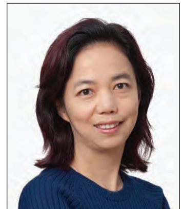
FEI-FEI LI, PHD

"Radiotherapy to Convert the Tumor into an In Situ Vaccine"